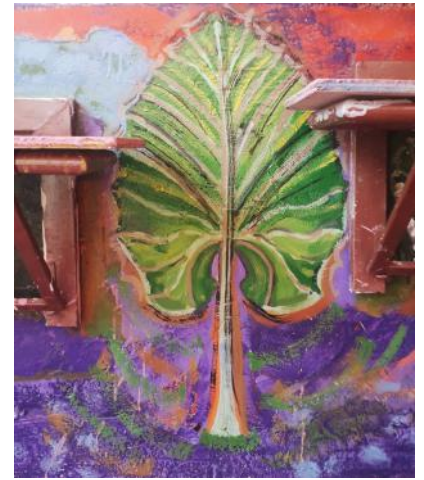
School decorations in Accra