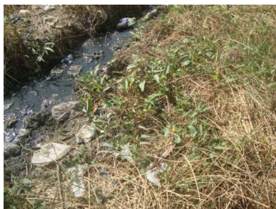
Rainwater around the school