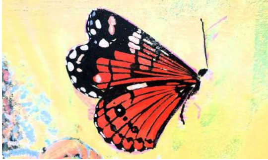
School decorations in Accra

Since all school activities were suspended in March due to the pandemic, we have taken the opportunity to improve and beautify both facilities.