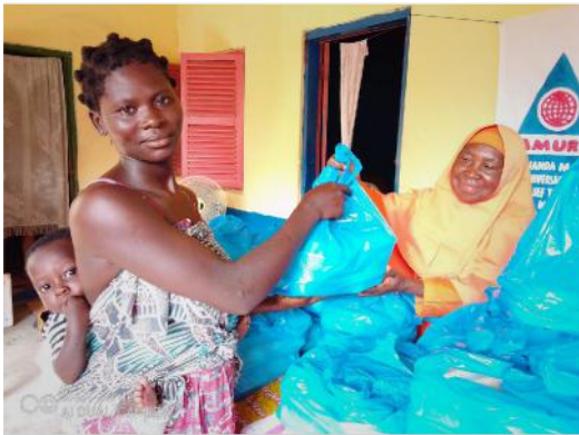
Mass feeding in Akwakwaa