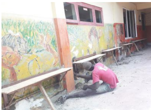
School painting in Accra

Besides, with the support of Aile Universelle , we have painted beautiful art works on the walls for the joy of the children. Nature was chosen as the main subject for those works of art to help children develop love for plants and animals. Thanks to this funding, we have been also able to paint all school facilities.