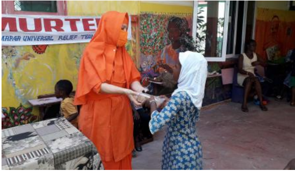
Mass feeding in Laterbiokoshie, Accra