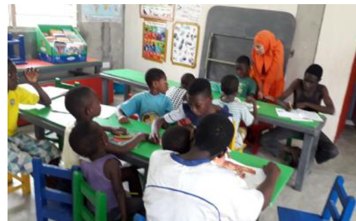
Path of Joy Center in Kasoa