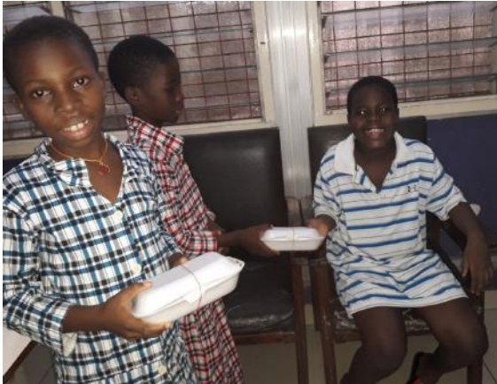
Visiting sick children at the Korlebu Hospital

In Accra, we are running children's homes for girls with the support of AMURT Italy . We provide girls with nutritious food and offer them alternative education; we give them the opportunity to cultivate fine arts, such as music, dance and painting; and teach them moral principles. For instance, they learn to help the others as they visit the sick and give food to street people.