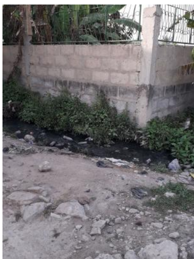
Rainwater around the school

We urgently need to build a gutter at the entrance to make the place safer for young children who come to the facility. Besides, rainwater around the school weakens the fence. We are using gravel around the fence as a temporary fix for that problem.