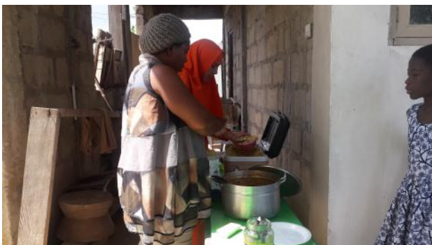
Mass feeding in Kasoa