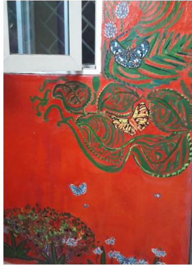
School decorations in Accra