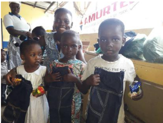
Trousers distribution in Akwakwaa

This year we have organized mass feedings and clothes distribution in different locations in Ghana.