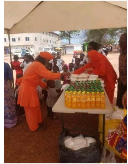
Mass feeding in Haatso