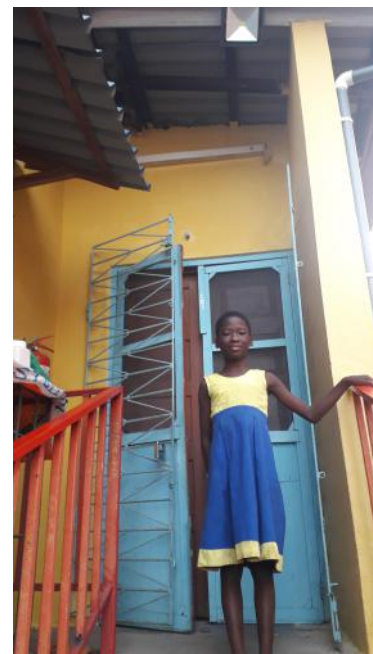
Painting the walls