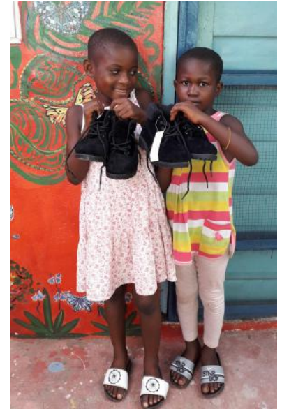
Shoes distribution in Accra