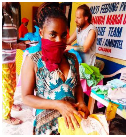
Clothes distribution in Akwakwaa