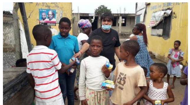
Mass feeding in Sukhura