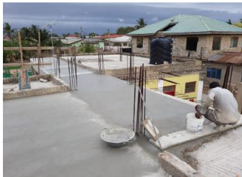
Roof of Path of Joy, Kasoa