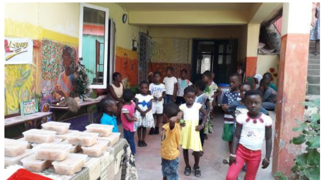
Mass feeding in Laterbiokoshie, Accra