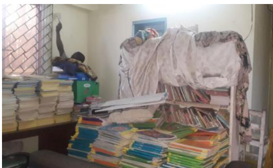
Painting the walls