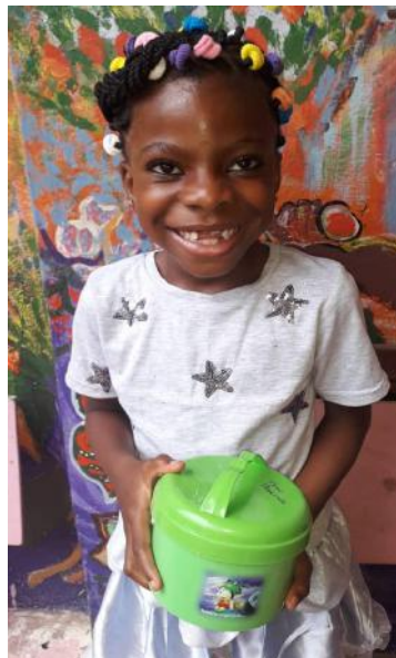
Scholarship programme in Accra