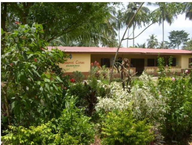
Clinic in Akwakwaa

Since 1984, AMURT-EL has been active in providing health services. We opened numerous primary health outposts in the rural areas of Greater Accra and in the Central Region of Ghana. AMURT-EL workers started out with pre-schools and supplementary feeding programmes in the Amasaman district (Obom Area) of the GA region. Yet, it became clear soon that one of the most urgent needs were primary health facilities because of the water-borne diseases such as guinea worm, cholera and yaws that were rampant at that time.